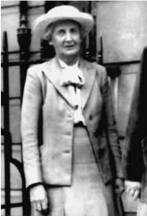
Fig 1. Lucy Wills – Honorary Consultant Pathologist to the Royal Free Hospital and graduate of Cambridge and the Royal Free Hospital School of Medicine. She worked in India for some years and was internationally recognized for her research on anaemias of pregnancy, one of which bears her name. She was independent and radical in outlook and a strict and stimulating teacher.